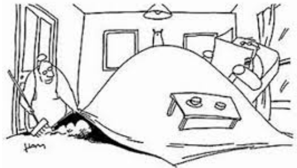
Figure 4. Covering sins for thousands of years is somewhat represented in this cartoon. By the time of Christ, the situation was more like a mountain of sin with a little rug on top trying to cover it up. However, a day was coming when " I will remember your sins no more " (Jer. 31:34).

millennia, with hundreds of thousands of people offering sacrifices, God refrained (called forbearance) from judging those sins. Eventually, the matter of God's forbearance came into question. How could a righteous God go on and on covering sin and not really getting rid of it (true forgiveness)? Something more than the OT sacrificial system was needed to truly deal with the penalty of sin. God was passing over sin, covering it up, and driving it out of sight; but, this could not go on forever.