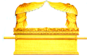
Figure 2. Representation of the Ark of the Covenant.

Satan was the anointed cherub (Ezek. 28:14) and had a special position around the throne of God. Imagine that, Satan, an anointed cherub, with the duty of assuring the holiness of the throne.