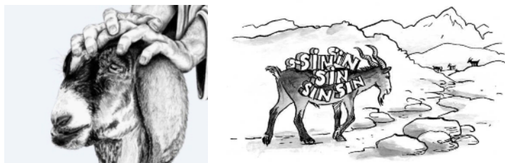
Figure 3. Both hands were placed on the innocent goat's head and the sins of the people were confessed. The

In Leviticus 16, one goat was killed, as mentioned above. However, the other goat was not killed, and this goat teaches us what was really happening in God's sight. The High Priest would place both hands on this goat, confess the sins of the people, and then the goat—laden with the sins of others but not its own—was sent into the wilderness. This was the scapegoat . The people's sins were transferred to the innocent scapegoat, which then carried the sins away into the wilderness, never to be seen again. The sins were out of sight, no longer to be remembered by the people. After the goat was released, God could act mercifully to the people because the scapegoat was an atonement that allowed God and humans to be temporarily reconciled. Sin was taken out of sight and not seen by humans, although it was still known by God. True resolution of the sin problem waited the day when God's righteousness and justice were vindicated, that is, the day when Someone would make it possible truly to take sin away and wipe it out, forever. The scapegoat was a symbol of the Sin-bearer to come, Who took away the sins of the world.