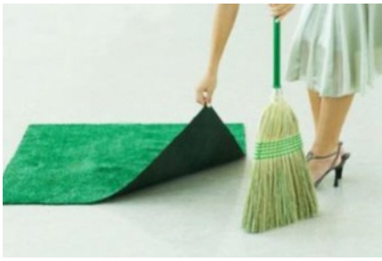
Figure 1. Atonement can be likened unto sweeping dirt under a rug. Each speck of dirt is a sin, but the sin is well covered. The dirt is out of sight and no one knows it is there but the person who put it there. The sin still exists, but life can go on, as if the floor were clean.