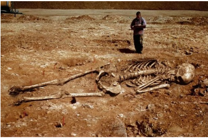
Picture 1. Example of supposed giant, but it is fake. (crystalmarylindsey.blogspot.com)