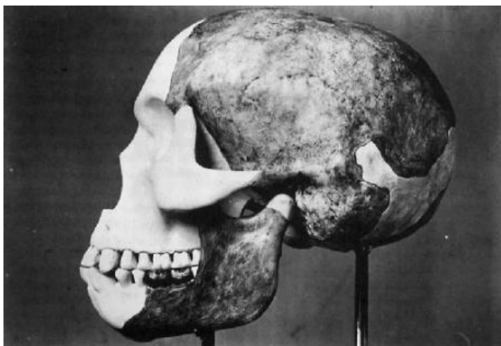
Picture 3. Piltdown man skull. The human and orangutan bones are darker in color and the reconstructed areas are lighter (so you can distinguish the two). However, the entire specimen is a hoax.