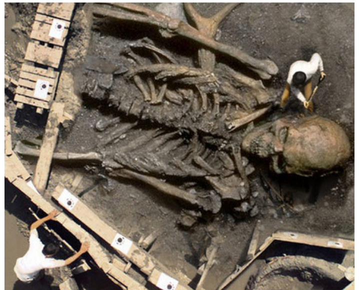
Picture 2. Reportedly this is a biblical giant, but really it is only an entry in a photo contest.