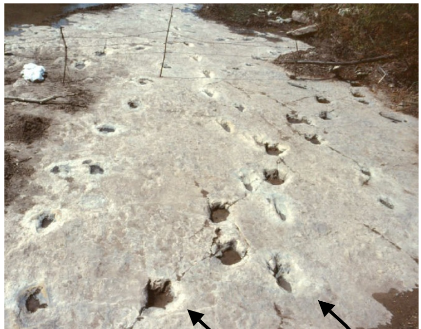
Picture 4. Taylor Site, Paluxy Riverbed, 1984, Glen Rose, TX. The Taylor Site contains several track ways of largely in-filled, metatarsal dinosaur footprints, once considered human by many Christians, and a trail of deeper, more typical digitigrade dinosaur tracks. (Note: digitigrade footprints are made when an animal walks mostly on the toe part of the foot; cats and dogs make digitigrade tracks. Metatarsal footprints are made when an animal walks with more of its foot on the ground and thus a longer footprint is made. If the soft "mud-like" material collapses or fills-in from the edges, a metatarsal track may look "sort of" human to the untrained eye.)