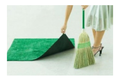
Figure 1. Atonement can be likened unto sweeping dirt under a rug. Each speck of dirt is a sin, but the sin is well covered. The dirt is out of sight and no one knows it is there but the person who put it there. The sin still exists, but life can go on, as if the floor were clean.